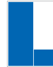
1/2 Vertical & Business Card